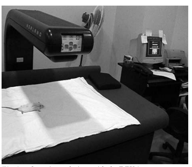
Fig. 2. Scanning technique with the DEXA scanner.

mize the interobserver variations, same technician carried out all analyses. Measurement process was repeated three times for each rat in order to assess the efficiency of the measurement method. The coefficient of variation was 1.4% for lumbar spine and 1% for femur diaphysis.