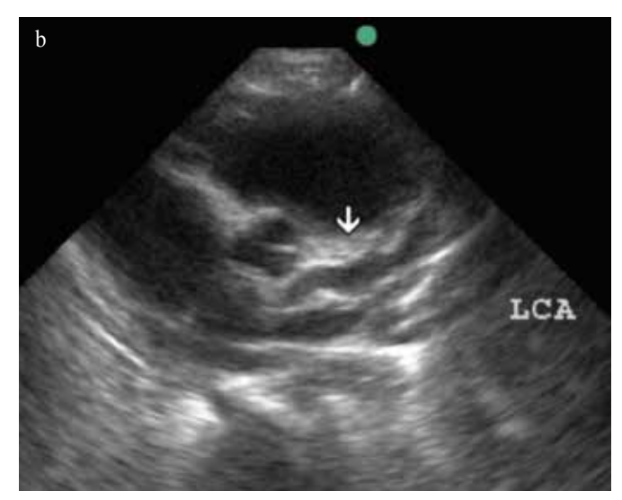
FIG. 1. a, b. Dilated right coronary artery with a diameter of 4.4 mm (a), dilated left coronary artery with an aneurysmal dilatation and a maximum diameter of 6.5 mm (b)