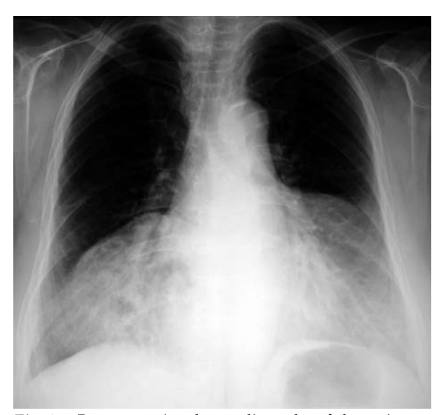
Fig. 1. Posteroanterior chest radiography of the patient at admission shows right paracardiac mass, bilateral lower lobe atelectasis and radioopacity.

A 76-year-old woman weighing 114 kg presented to the emergency room with worsening chest pain and shortness of breath on physical exertion for two years. There was no significant past medical history or trauma. Auscultation revealed no audible breath sounds in the bilateral lower sites of the chest. Physical examinations revealed stable vital signs. The laboratory results were in normal limits. In electrocardiography (ECG); T wave negativity in D2, D3, aVF, and low voltage were determined in all derivations. Echocardiogram measured normal cardiac chamber volumes and ejection fraction. She had no abdominal symptoms of pain, food intolerance, emesis, nausea, vomiting, cramping and distension. A posteroanterior chest radiography showed right paracardiac mass, bilateral lower lobe atelectasis and radiopacity (Fig. 1). Computed chest tomography (CT) revealed an anterior diaphragmatic hernia through Morgagni defect, transverse colon and omentum in the anterior mediastinum, compressed bilateral lung parenchyma and cardiac shifting to backward (Figs. 2a, b). The patient was diagnosed as bilateral, giant Morgagni hernia. She was transferred to the general surgery department for elective laparotomy. Laparotomy was planned for reducing abdominal contents into peritoneal cavity and repairing diaphragmatic defect. An elective transabdominal surgical repair via