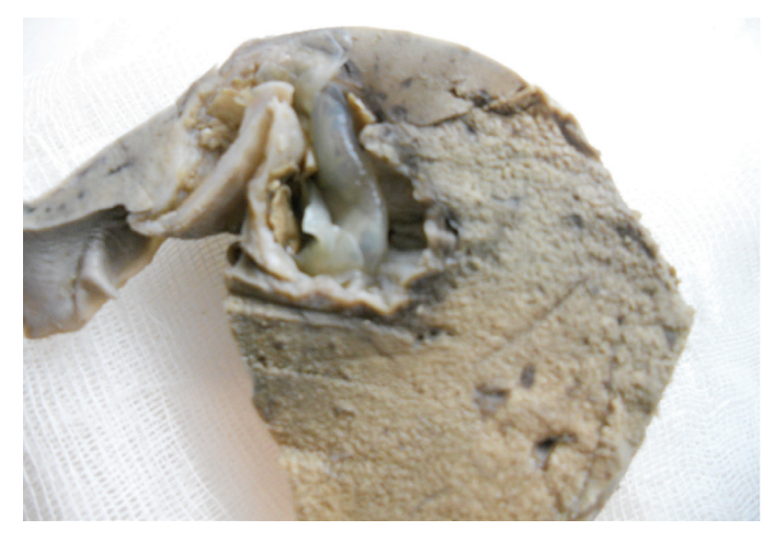
FIG. 1. Hydatid cyst in the liver.

The case was a 15-year-old boy, without any known prior illness. He was admitted to the hospital after feeling unwell and dropping to the ground while playing ball, and subsequently died. During the internal autopsy examination in our institution, a cystic structure, with dimensions of 13x6 cm, was observed in the left lobe of the liver. Hydatid cyst was not found in other organs of the body. In a macroscopic examination of the liver, a smooth-bordered cystic structure, with dimensions of 13x5x4.2 cm, was observed (Figure 1). On the sectional surface, a white membranous structure and haemorrhagic fluid were observed. The histomorphological examination of liver sections obtained from the cystic area revealed findings consistent with a hydatid cyst invading the external wall, the cuticular layer, and the germinal layer (Figure 2). In addition, the histomorphological examination of liver sections showed a fresh haemorrhage in areas near the cystic wall and scolices in the hepatic lumina (Figure 2), and the histomorphological examination of pulmonary sections showed scolices observed in pulmonary vessel lumina, thus a non-thrombosis hydatid embolism was diagnosed (Figure 3). No toxic agent was identified in a toxicological analysis. Based on the findings, the cause of death was recorded as a non-thrombotic hydatid embolism.