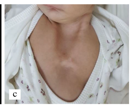
FIG. 1. a-c. Axial section of preoperative computed tomography scan showing the partial superior sternal cleft with the complete lack of fusion of the sternal bars (a). Three-dimensional reconstruction showing the split sternum bones with the ossification center (b). Preoperative view of the anterior chest Wall (c).

Address for Correspondence: Yekta Altemur Karamustafaoğlu, Department of Thoracic Surgery, Trakya University School of Medicine, Edirne, Turkey Phone: +90 284 235 59 36 e-mail: altemurk@hotmail.com ORCID: orcid.org/ 0000-0002-5491-1219 **Received: 25 May 2018** Accepted: 29 November 2018 • DOI: 10.4274/balkanmedj.galenos.2018.2018.0955