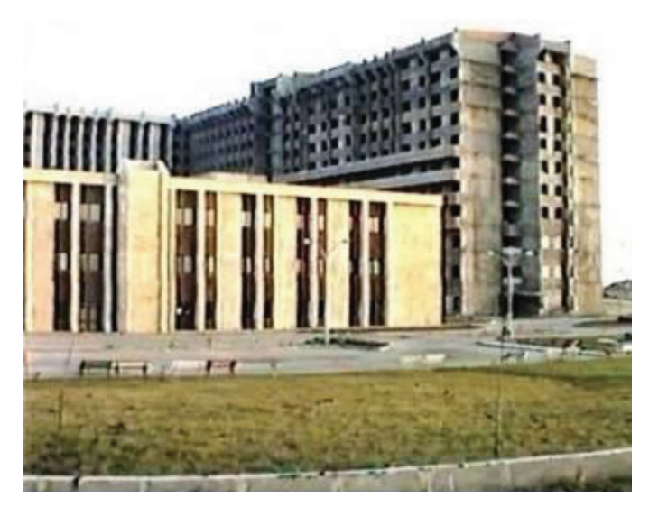
FIG. 8. Completed B-block and carcass A-blocks of the Faculty of Medicine (1984).

The construction of the Faculty of Medicine was continued rapidly in the Hadımağa location. The preclinical departments which were going to be taught in the first, second, and third years (Anatomy, Physiology, Histology-Embryology, Biochemistry, Deontology) and Basic Clinical (Pathology, Pharmacology, Microbiology) were placed in B-block temporarily. While the A-blocks and C-blocks were under construction, courses, practices and exams were conducted simultaneously in the B-block (Figure 8).