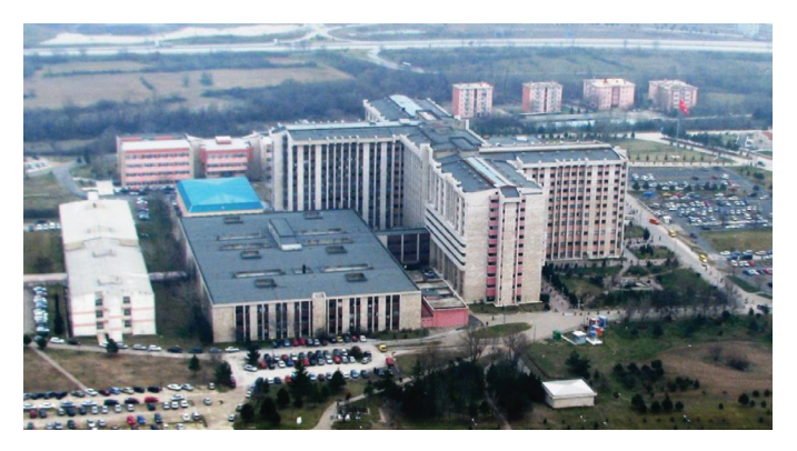
FIG. 9. Trakya University Faculty of Medicine (completed in 1999).

In 1997, the Menza Building, (kitchen and cafeteria) came into service. In this building, spaces for students' health, social, cultural, and sporting activities were allocated. The D1 and D2 Buildings envisaged for Basic Medical Sciences were completed in 1998, and they moved to the main locations of the Departments in the Polyclinic Building (B-block). Polyclinic units and Radiodiagnostics, Radiotherapy, and Nuclear Medicine were located there. The dialysis unit and cardiovascular surgery were put into service the same year, and open heart surgeries were started. In 1999, the construction of all of the 11-floor A-blocks (Inpatient Services, Clinical Departments) was completed (Figure 9). It was opened on 25 November 1999 on the day of salvation of Edirne. The modern University Hospital with 750 beds is in Turkey's European territory. Twenty-six years ago, Süleyman Demirel, who laid the foundation of the Faculty as the Prime Minister, participated as the President this time and distributed plaques to those who had contributed. In the same year, the indoor sports hall was also put into service.