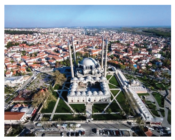
FIG. 1. Edirne Selimiye Mosque (1574).

Trakya University Faculty of Medicine, located in the west and Turkey's European territory of Edirne (old Adrianopolis), has been operating in the city. It is 220 km west of Istanbul, 22 km from the Bulgarian border, and 7 km from the Greek border. It was founded by the Roman Emperor Hadrianus in 130 A.D. at the strategic point where the Balkan peninsula meets the three streams (the Meriç, Tunca, and Arda rivers) that give life to the Thracian lands. It was conquered by the Ottomans 92 years before the conquest of Istanbul in 1453 and assumed the starting point and shareholder duties of later European conquests. Its palaces, bridges, mosques, bazaars, fountains, and madrasahs offer extraordinary historical and sacred value for the Turks. The most spectacular Ottoman Mosque (Sultan Selim II Mosque) rises in the middle of the city (Figure 1) (1).