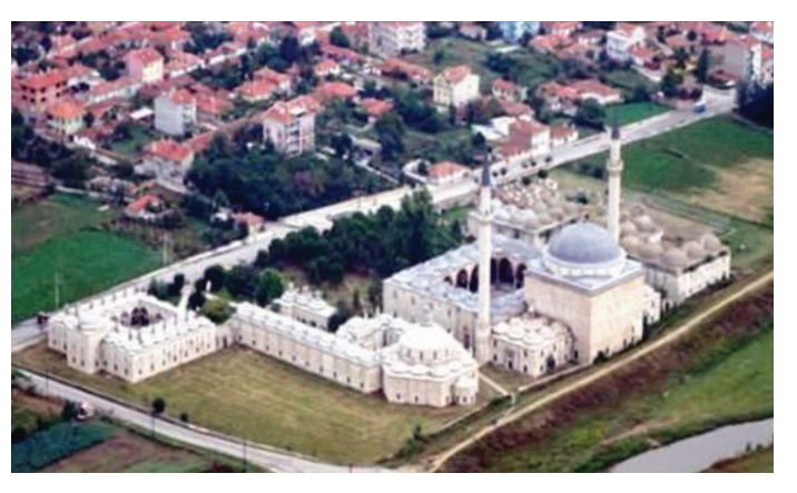
FIG. 2. Sultan II Bayezid Complex: Left side Medical Madrasa and Darüş-şifa (1488).

Tunca river. Half of the complex was commissioned in 1488 as a hospital (Dar'üş-şifa) and medical school (Medrese-i etibba) near the mosque (worship), tabhane (hotel), imaret (charity supplying free daily bread) (Figure 2) (4).