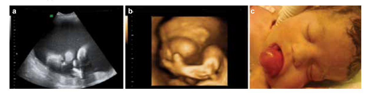
FIG. 2. a-c. Polyhydramniosis and fetal oropharyngeal mass (a), 3D sonographic apperance of the mass (b). Postnatal apperance of the protruding mass from mouth (c).