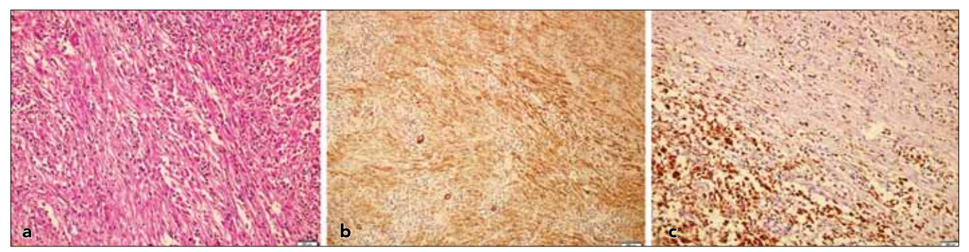
Figure 2. a-c. Staning indicates the Inflammatory cells (plasma cells, lymphocyte and histiocyte) in myofibroblastic proliferation (HE; x200) (a), Immunohistochemically SMA positive staining myofibroblasts (DAB; x100) (b) and CD68 positive histiocyte clusters (DAB;x200) (c).