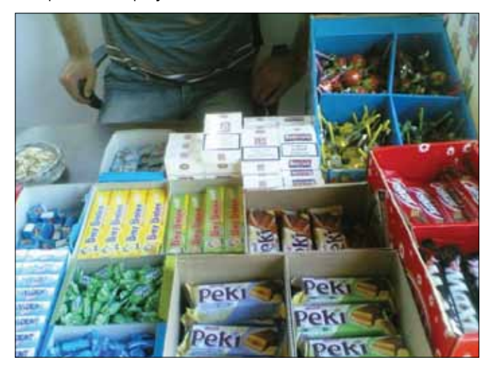
Figure 1. An example of a tobacco "powerwall" set up with goods for children such as chocolate, candy, chewing gum, etc

According to the retailer list from the city authority, there were 520 retail tobacco outlets currently active. Shopping centers had only one license, but had multiple sales stands and point of displays. When sale stands were counted individ-