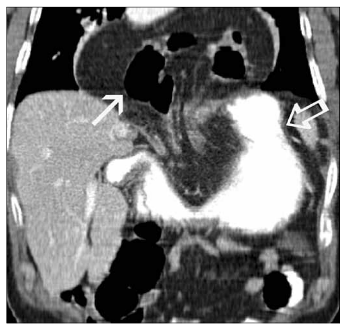
Figure 1. CT coronal curved planar reconstruction showing isolated herniation of the mid-part of the transverse colon into the mediastinum via a wide esophageal hiatus (arrow). The esophagogastric junction and stomach are located normally (open arrow)