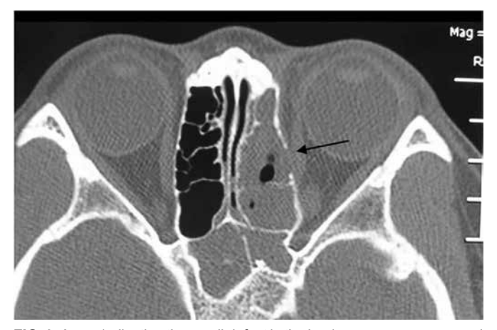
FIG. 3. Arrow indicating the small defect in the lamina papyracea removed by ESS (Case 1)