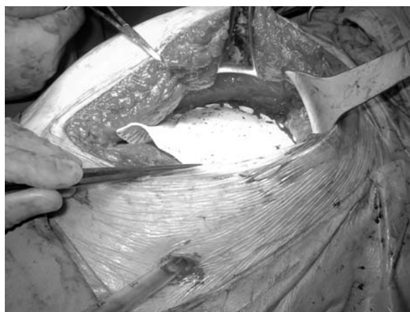
Fig. 2. Large defect reconstructed with polytetrafluoroethylene (PTFE) mesh.

Radioiodine ablation therapy was carried out in three patients, except for one medullary carcinoma patient. One synchronous papillary