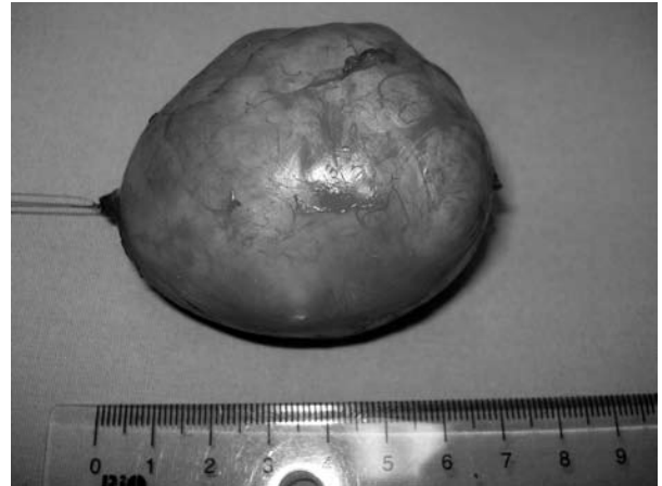
Fig. 2. Postoperative photograph of ganglioneuroma.

show any atypia (Fig. 3). The spindled tumor cells showed strong positive reaction for S-100 protein and were negative for synaptophysin, desmin and \alpha smooth muscle actin immunohistochemically (Fig. 4).