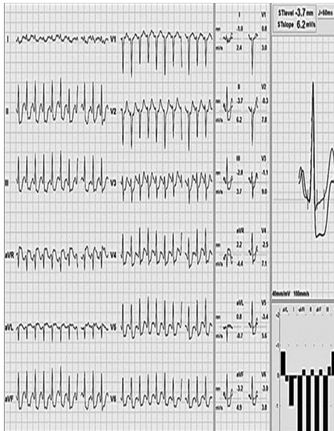
FIG. 2. A cardiovascular treadmill stress test showed significant ST depression in the inferior leads and lateral precordial derivation.