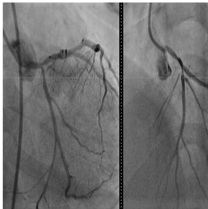
FIG. 3. Conventional coronary angiography revealed a significant occlusion of the left anterior descending artery and circumflex artery.