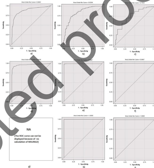
FIG. 2 a-i. The plot of Receiver Operating Characteristic curves for each parameter a) median sensory-ulnar motor latency difference for mild carpal tunnel syndrome b) Terminal Latency index for mild carpal tunnel syndrome c) Residual Latency for mild carpal tunnel syndrome d) median sensory-ulnar motor latency difference for moderate carpal tunnel syndrome e) Terminal Latency index for moderate carpal tunnel syndrome f) Residual Latency for moderate carpal tunnel syndrome g) median sensory-ulnar motor latency difference for severe carpal tunnel syndrome h) Terminal Latency index for severe carpal tunnel syndrome, and i) Residual Latency for severe carpal tunnel syndrome.

Fig. 2 shows the lowest 1-specificity point corresponding to the highest sensitivity value of the cut-off ROC curve for each parameter (25). Comparing controls against all CTS patients (Table 3), using a cutoff value of > 0.8 msecs, the MSUMLD showed