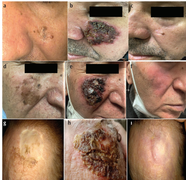
FIG. 1. Case 1: Initial presentation (a), severe inflammation during treatment (b), and complete resolution after treatment (c). Case 2: Initial presentation (d), severe inflammation during treatment (e), and complete resolution after treatment (f). Case 3: Initial presentation (g), severe inflammation during treatment (h), and complete resolution after treatment (i).