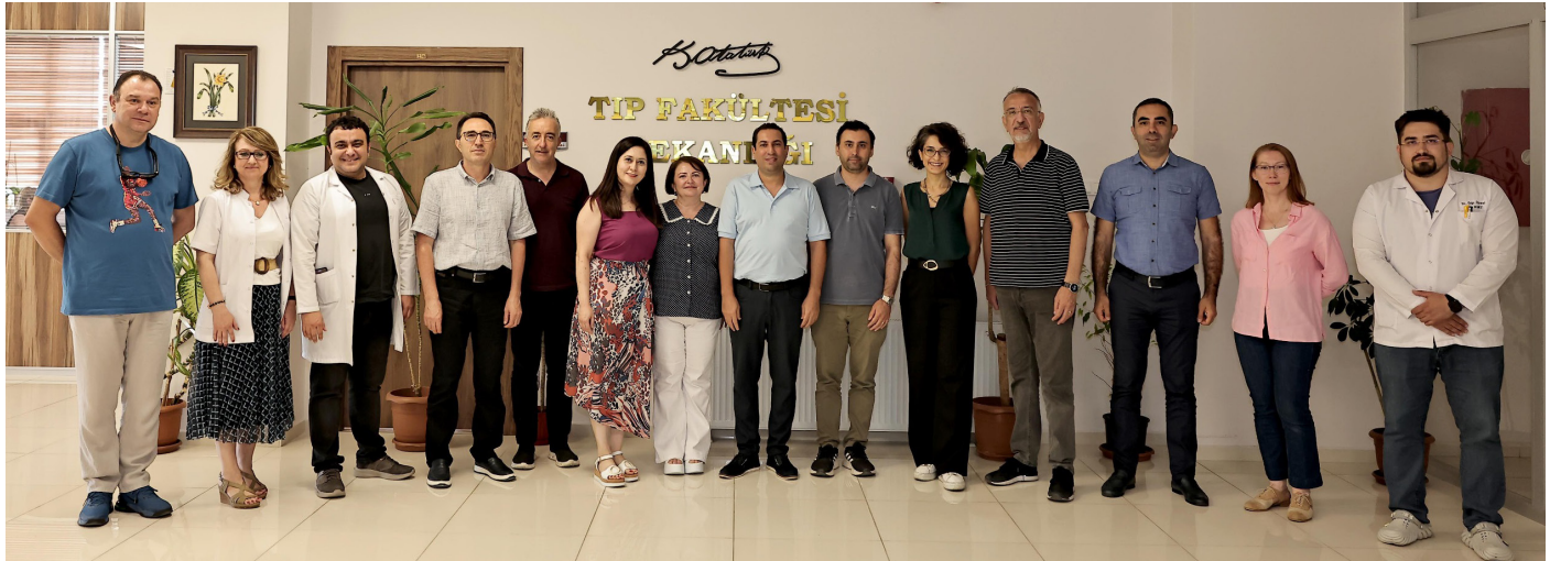
Balkan Medical Journal Editorial Board

Department of Cardiology, Trakya University Faculty of Medicine, Edirne, Türkiye Editor-in Chief Balkan Medical Journal