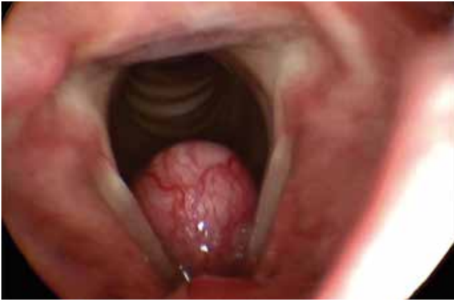
FIG. 1. On endoscopic examination, a round, well-demarcated lesion was noted midline at the level of the subglottis. The lesion was covered by dilated vessels.