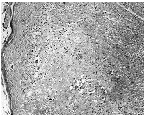
Fig. 2. Partially degenerated and partially calcified/ossified mesenchymal lesion with well defined borders (H-E x 40).

The specimen which was 2x1.5x0.7 cm in size, was gray-white with a rough, somewhat irregular outer surface. Its cut surfaces were heterogeneous, rubbery and had a gray-white color. Five micrometer-thick sections were obtained from the formalin fixed and paraffin embedded tissues and stained with hematoxylin and eosin.