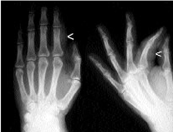
Fig. 1. Soft tissue swelling (arrow heads) in the index finger of left hand. There is no periosteal reaction in the underlying bone.

studies revealed a normal white blood cell count and erythrocyte sedimentation rate and C-reactive protein concentration. There was no known history of a previous trauma. On palpation, the mass was hard and appeared fixed to the surrounding tissues. A plain radiogram taken on admission revealed a soft tissue swelling with suspicious calcification in the proximal phalange of the index finger of the left hand. The mass did not show any association with the underlying bone neither surgically, nor radiographically and was removed surgically with 0.3 cm safety margins (Fig. 1). The flexor tendon of the finger was also intact.