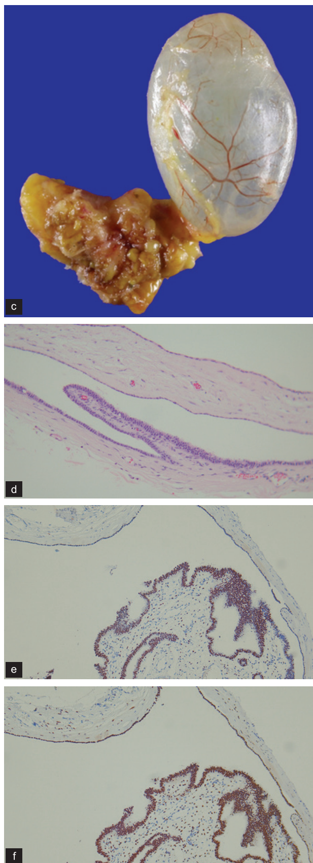
FIG. 1. a-g. Contrast-enhanced axial (a), and coronal (b) chest CT show a well-defined ovoid thin-walled cystic mass without enhancement (arrows) in the left paravertebral space adjacent to the tenth vertebra. The resected specimen (c) demonstrated a cyst with a thin, translucent wall containing clear watery fluid. On histological examination, the inner surface of the cyst was lined with flattened, cuboidal or ciliated columnar epithelium, and was supported by underlying fibrous stroma (d). Immunohistochemical stainings for estrogen receptor (e), progesterone receptor (f), and Wilm's tumour 1 (g) revealed positive nuclear staining (a: haematoxylin and eosin original magnification 200 \times ; b: ER 100 \times ; c: PR 100 \times ; d: WT1 100 \times ).

history and hormone replacement therapy have been reported to be frequent in patients with these cysts (3). The origin of mediastinal Müllerian cysts has yet to be firmly described. Several theories have been proposed to explain the histogenesis of Müllerian cysts in the mediastinum. Hattori (2) suggested that the cysts may be derived from misplaced mesothelium and mesenchyme with Müllerian characteristics similar to retroperitoneal Müllerian cysts. However, the fact that cysts in the retroperitoneum often have endocervical differentiation unlike mediastinal cysts implies that mediastinal Müllerian cysts are not simply a counterpart of retroperitoneal Müllerian cyst. Batt et al. (4) insisted that the cysts were directly originated from the primary Müllerian apparatus by adopting Ludwig's theory of the pathogenesis of the Mayer-Rokitansky-Küster-Hauser syndrome (5). Mediastinal Müllerian cysts are seen as homogeneous, thin-walled cysts without enhancement on CT. They are usually located at the posterior mediastinum, especially the paravertebral space (6). However, these findings are not specific for Müllerian cysts and are also encountered for other mediastinal cysts. Final diagnosis can be made by histological findings. Microscopically, ciliated epithelium with Müllerian differentiation confirms a diagnosis. Immunohistochemistry with positive staining for ER, PR, WT1 and PAX-8 may be helpful (7).