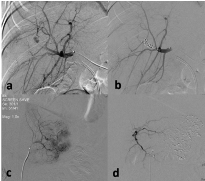
FIG. 2. a-d. Superselective hepatic angiography demonstrated hepatic artery aneurysm and bleeding in a 6-year-old boy with hemobilia (a). Coil embolization was performed (b). Active bleeding from the left gastric artery was detected by angiography in a 15-year-old boy (c). Embolization stopped the bleeding (d).

Accessing the pediatric vessels can be more challenging because of their smaller size and the vulnerable nature in contrast to those of