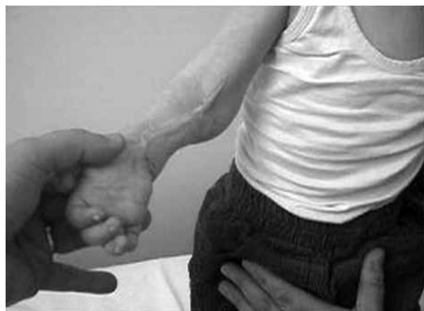
Fig. 2. At 4 months of age, following debridement and fasciotomy. Note the hypertrophic scar.

From the etiologic point of view, Cham et al. [2] reported cases of neonatal compartment syndromes with