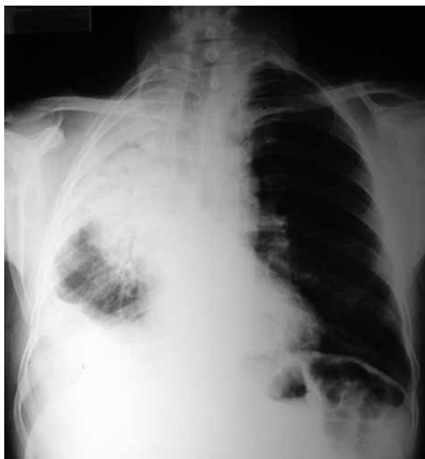
Fig. 3. Chest X-ray graphy showing pleurisy and lack of aeration on the right upper and middle lobes.

adenocarcinoma. No additional distant metastasis was detected.