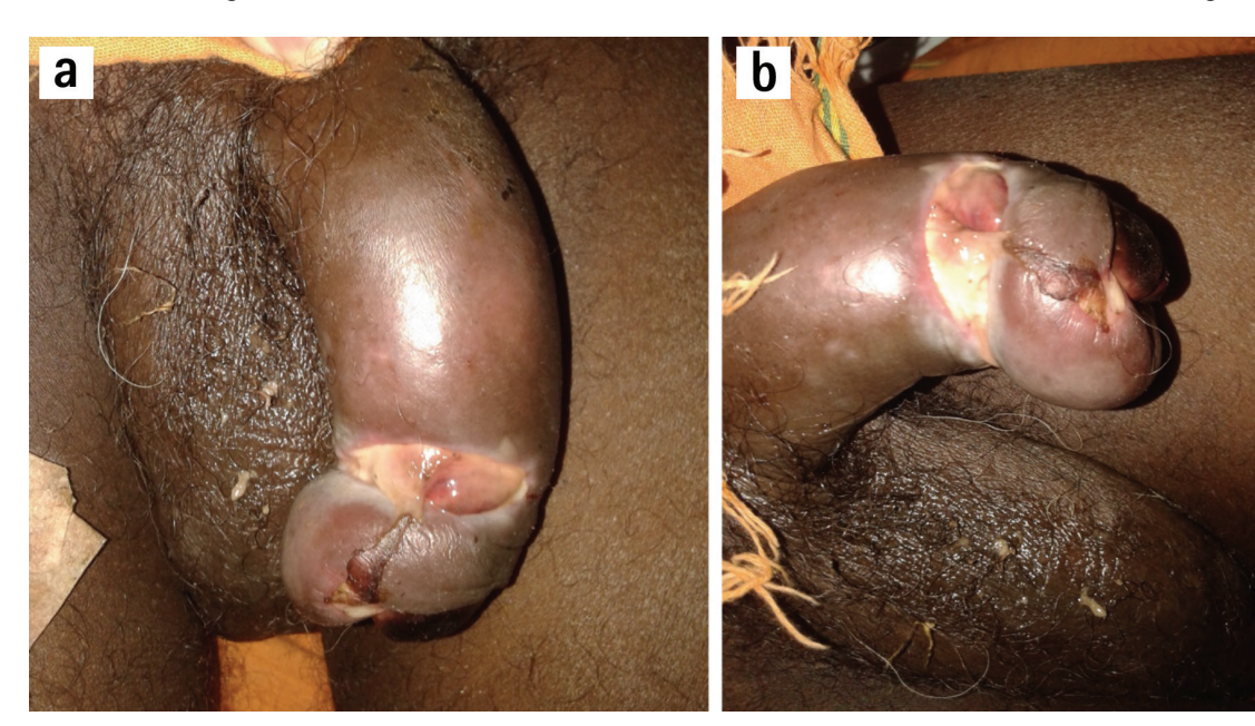
FIG. 1. Black discoloration of glans penis with penile oedema (a). Dry gangrene of glans penis secondary to paraphimosis (b).

On physical examination, pulse rate of 104/minute, and blood pressure of 110/64 mm Hg were recorded. On local examination, dry gangrene of the glans with penile shaft oedema with paraphimotic ring with sloughing of penile skin was present (Figures 1, 2). Blood and serum chemistry demonstrated anaemia (haemoglobin 8.6 GM%), leucocytosis (total leukocyte count 18000/mm³) and deranged renal function (serum creatinine 2.1 mg/dL), suggestive of systemic inflammatory response syndrome. Fasting blood sugar was 94 mg/dL. Screening for hepatitis B, hepatitis C and human immunodeficiency virus was negative. Urine culture was positive for Escherichia coli, having a colony count >105/ high power field, which was sensitive to piperacillin and tazobactam, levofloxacin, amikacin, meropenem, and colistin.