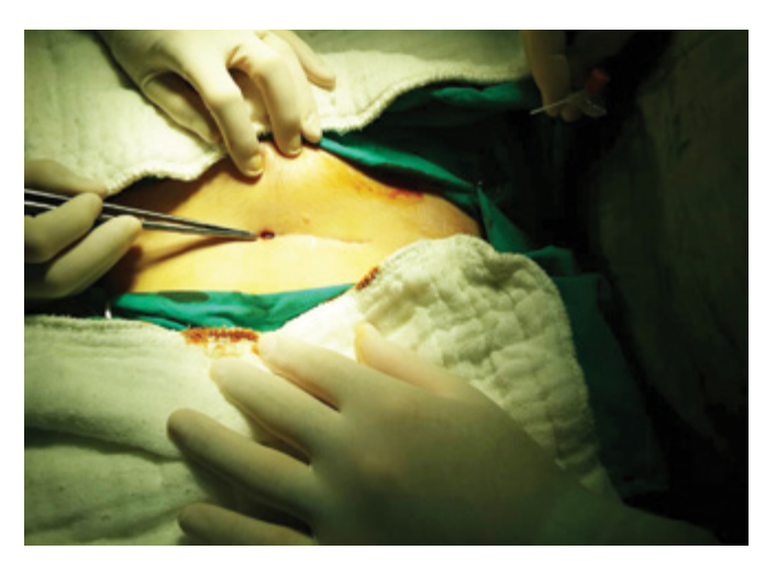
FIG. 1. The fistulous opening in the abdominal incision scar

Akkurt et al. Utero-cutaneous Fistula 427