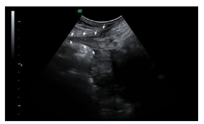
FIG. 2. Two dimensional sonography view shows fistulous tract (arrows)

underwent explorative laparotomy and hysterectomy. Intraoperatively, the fistula was seen to be extended to skin from the right cornual part of the uterus. Endometrial epithelialization of the fistula tract was observed grossly visible during the operation. Histopathology of the fistulous tract showed endometrial epithelization and the tract lined by granulation. Also, histopathological examination showed several uterine fibroids with various dimensions. She was discharged from the hospital 5 days after the surgery and made a return visit one month later. She had no complaints and there was no pathology according to her physical examination. Written informed consent was obtained from the patient before preparation of this manuscript.