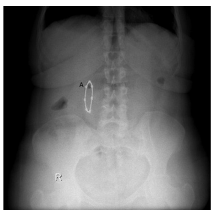
FIG. 1. The tubular part of the balloon is seen in the duodenum on the abdomen X-ray. The tubular part of the balloon.