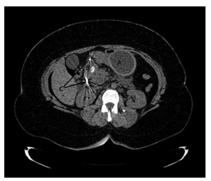
FIG. 2. The balloon and its tubular part are seen on computed tomography. Intragastric balloon (a). Duodenum (b). The tubular part of the balloon (c).