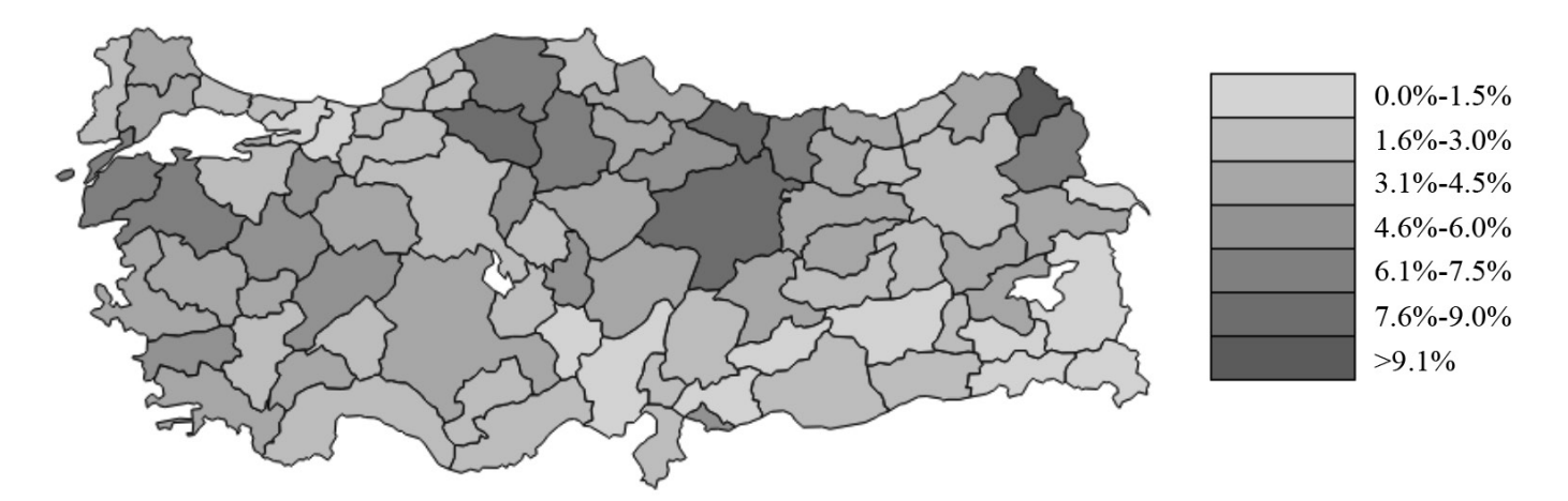
FIG. 2. The distribution of prevalence of outpatient admissions of patients with chronic obstructive pulmonary diseases (COPD) in Turkey, according to the provinces, 2016