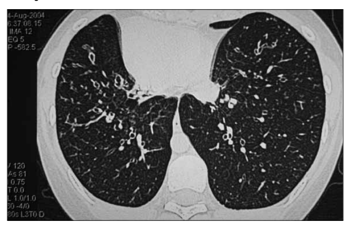
Figure 2. CT scan of thorax showing bilateral bronchiectasis

completely, and the natural ostia of the right and left frontal, maxillary, and sphenoid sinuses were enlarged. A mucosal sample was obtained from the ostium of the right maxillary sinus for electron microscopic examination. Scanning electron microscopic examination (Figure 3) showed that nasal mucosal cilia appeared normal and well organised. Transmission electron microscopic examination (Figure 4) showed that the inner and outer dynein arms of the cilia were missing; however, the '9+2' structure of nasal cilia was normal.