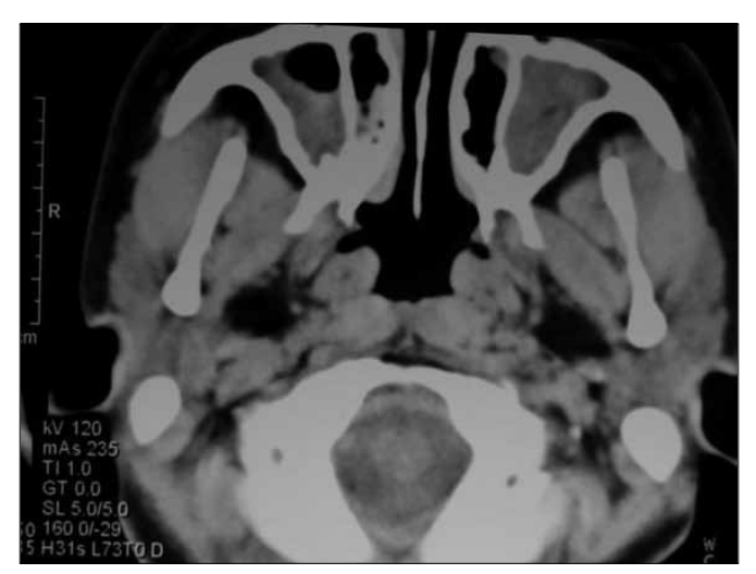
Figure 1. CT scan showing mucosal thickening in both maxillary sinuses