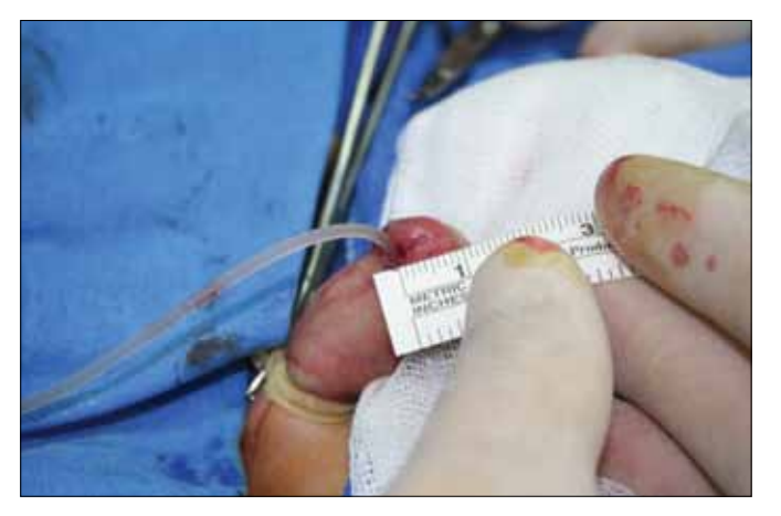
Figure 2. The distance between the urethral meatus and tip of the glans measured and recorded

Glans wings were wrapped around the urethra as in the normal configuration, and sutured with 2 layers of interrupted sub-epithelial 6/0 polydioxanone sutures. The deeper layer secured the urethra to the glanular tissue and the superficial layer approximated the glans wings. The anterior lip of the urethra was secured to the glans with four interrupted sutures, two on each side of the midline. The penile tourniquet, which was used intermittently during dissection, was removed when the glans reconstruction was completed. Circumcision was performed in all primary cases and the operation was terminated (Figure 5). A compression dressing was applied.