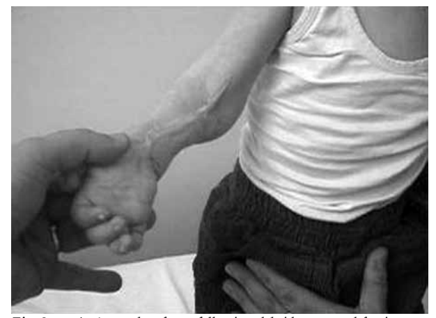
Fig. 2. At 4 months of age, following debridement and fasciotomy. Note the hypertrophic scar.

From the etiologic point of view, Cham et al.<sup>[2]</sup> reported cases of neonatal compartment syndromes with