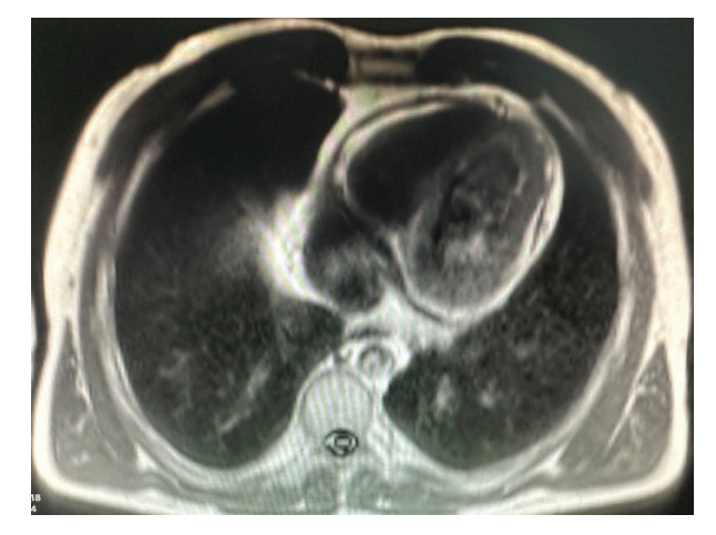
FIG. 1. Cardiac MR showing pericardial thickening and brightness. MR, magnetic resonance.

Constrictive pericarditis is a condition in which pericardial fibrosis leads to loss of elasticity, which subsequently affects ventricular filling.<sup>1</sup> Numerous factors play a role in the etiology of constrictive pericarditis. It may develop after viral infections or after vaccines that trigger autoimmune events.<sup>2</sup> However, it may also develop in patients with conditions such as microorganisms and systemic conditions such as neoplasia, autoimmune disorders, connective tissue diseases, and renal failure.<sup>3</sup> Neurological conditions such as Creutzfeldt-Iakob disease and clinical conditions such as lymphadenopathies have been reported following a COVID-19 infection or administration of its vaccines. 4,5 As with many diseases, including COVID-19, effective vaccination can reduce disease-related mortality.<sup>6</sup> Currently, the effects of the COVID-19 vaccine and those of the long-term disease remain highly debatable. Cardiovascular conditions are at the forefront of these. Although a few suspected cases have been reported in the literature, awareness of COVID-related constrictive