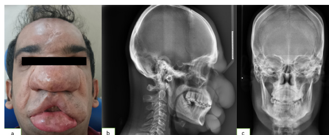
FIG. 1. (a) Swelling seen in the middle one third of face involving the nose, lips and commissures causing facial disfigurement; (b) Lateral cephalogram revealing the soft tissue profile indicating the bagginess created by the enlargement of soft tissues with sagging of the tissues from glabella till menton region; (c) PA Ceph showing soft tissue mass superimposed over the midline structures.

Rhinoentomophthoromycosis (conidiobolomycosis) is a relatively rare, chronic, subcutaneous zygomycosis that is characterized by a painless woody-hard swelling in the rhinofacial region. The condition causes severe facial disfigurement that resembles the facial contours of the hippopotamus. It usually occurs in the tropical rain forests of Africa, South and Central America, and South-East Asia. 1 The condition usually begins in the inferior turbinate and travels via the submucosa to the natural ostia, paranasal sinus, and subcutaneous tissue of the face, ultimately encompassing the upper lip, forehead, and periorbital regions. Although the lesions typically adhere to the