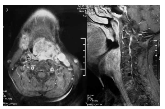
FIG. 1. A mass with a size of 2.4x1.3 cm narrowing the airway was observed in the lateral wall of the hypopharynx on axial MRI section of the neck (a). Sagittal MRI section of the neck showed a mass lining from the tracheal cartilage level to the parapharyngeal space (b).