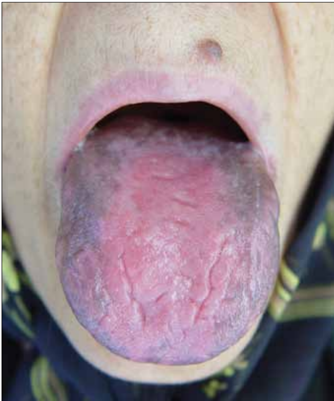
Figure 1. Physical examination showed hyperpigmentation on the lateral and dorsal parts of the tongue

A 55-year-old white woman receiving peginterferon alfa-2a (180 mg) and ribavirin (1200 mg) combination therapy for hepatitis C virus (HCV; genotype 1b) infection complained of a burning sensation and discomfort in her tongue in the second month, and tongue hyperpigmentation in the fourth month of the therapy. Physical examination revealed hyperpigmentation on the lateral and dorsal parts of the tongue (Figure 1). There was no hyperpigmentation on any other part of her body. Tongue biopsy was performed to exclude other causes, which revealed minimal parakeratosis, irregular acanthosis, melanin pigment and macrophage accumulation of subepithelial connective tissue, and also focal chronic inflammation (Figure 2).