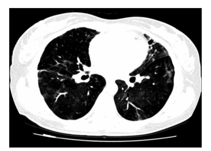
Figure 2. Chest CT indicating bilateral consolidation and diffuse infiltrates

tally expanded. Right pneumothorax and pleural effusion and bilateral fibrosis were detected on high resolution computed tomography (HRCT) scan. Closed chest tube drainage was attached and 15-20 mmHg of negative pressure was maintained. While the right lung was not re-expanded totally even with continuous suction for 11 days, she was transferred to thoracic surgery ward. She was discussed for pleural autologous blood patch but was not performed and lung was expanded 20 days later. She was discharged from hospital in healthy condition at the 24th day of her 2nd admission. She is still under long-term follow-up.