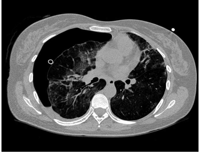
Figure 3. Chest CT showing pneumothorax