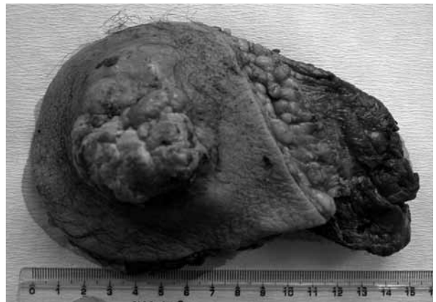
Fig. 1. A pink-purple nodular tumor with ulcerated surface.

Excision material was consisted of a pink-purple nodular lesion measuring 7 cm in diameter with an ulcerated center surface (Fig. 1). Microscopic findings revealed a tumoral lesion localized mainly in dermis, extending to the epidermis with solid sheets of cells. Tumor cells was found to have scant eosinophilic cytoplasm, oval or round nucleus without nucleoli (Fig. 2a, b) and a high mitotic rate. Diffuse punctate cytoplasmic staining for CK20, typical for MCC, and diffuse positivity for chromogranin and neuron specific enolase were seen in the tumor cells (Fig. 2c, d). The tumor did not stained with LCA and TTF-1.