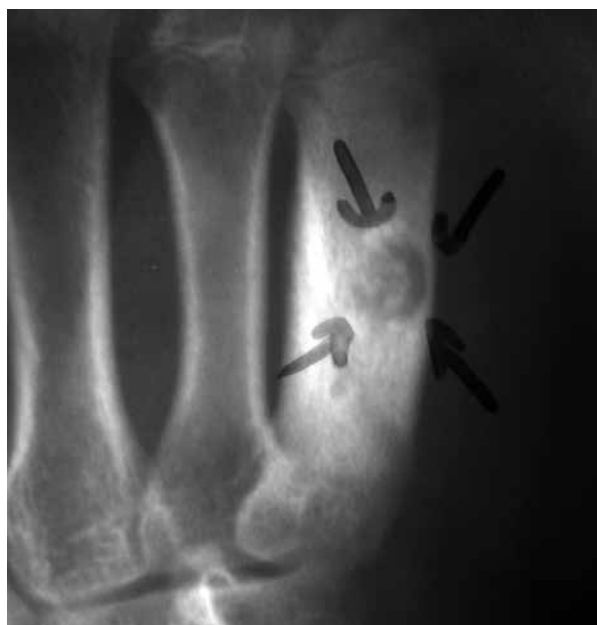
Fig. 1. Plane X-ray of the case.

Bilgin et al. [7] reported rare osteoid osteoma cases involving hand and wrist region to be 0.36% of all bone neoplasia,